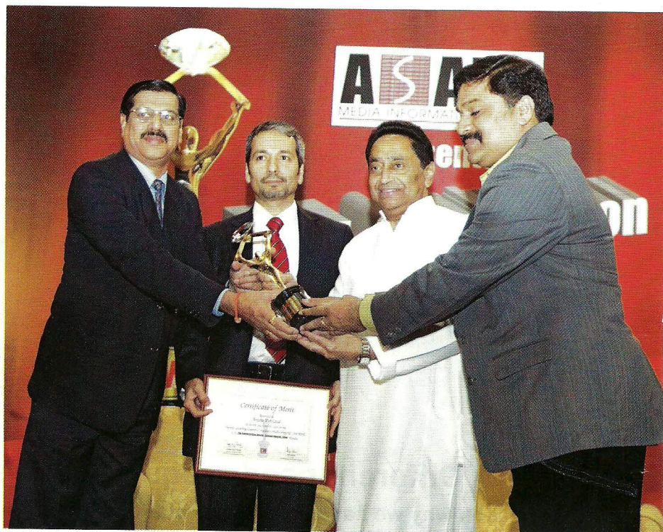
APCL receiving the 'Fastest Growing Cement Company' award in 2009

In its decade of existence, APCL was recipient of several awards. In 2009, APCL was the recipient of the "Fastest Growing Cement Company" award. The company was also awarded Certificate of Achievement for 'Demonstrating Exceptional