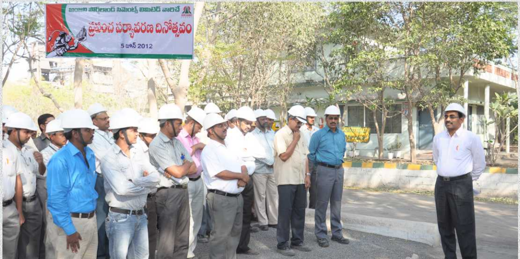
World Environment Day Celebrated at Anjani Plant