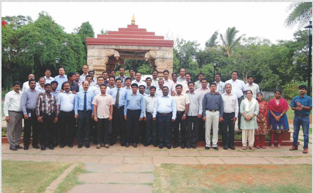
Anjani marketing team attending Annual marketing review meet at Hyderabad