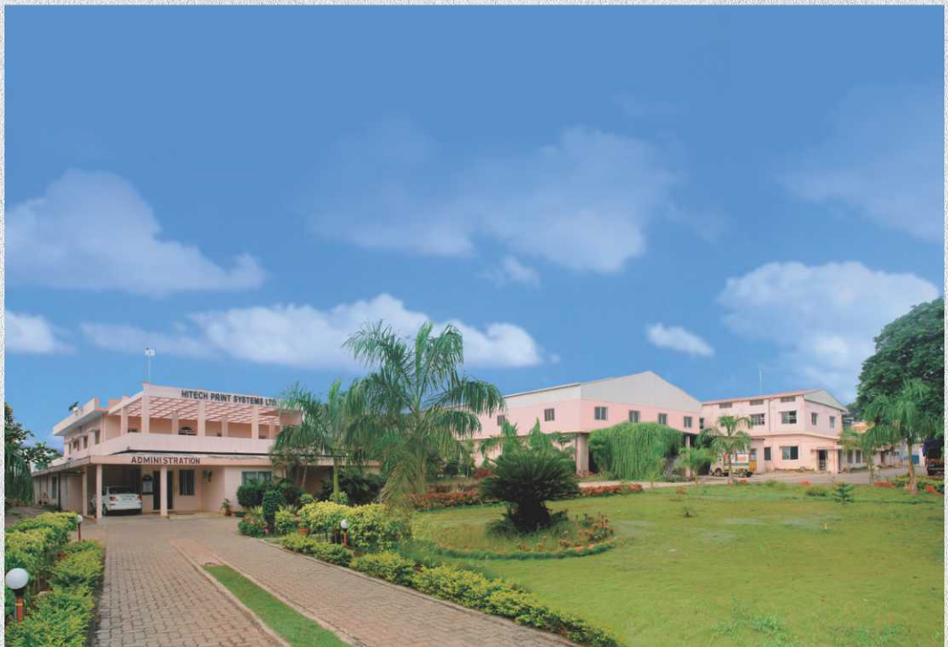
Hitech Print Systems Limited