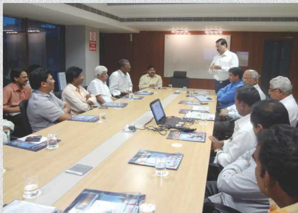
Meeting with Logistics Partners