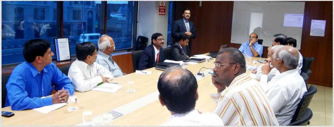
Auditing for ISO 14001-2004 (Environmental Management System) & BS ohsas 18001-2007 (Occupational Health & Safety Management) Certification by TUV-SUD