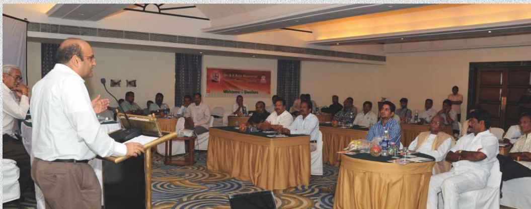
Dealers Meet at Vizag