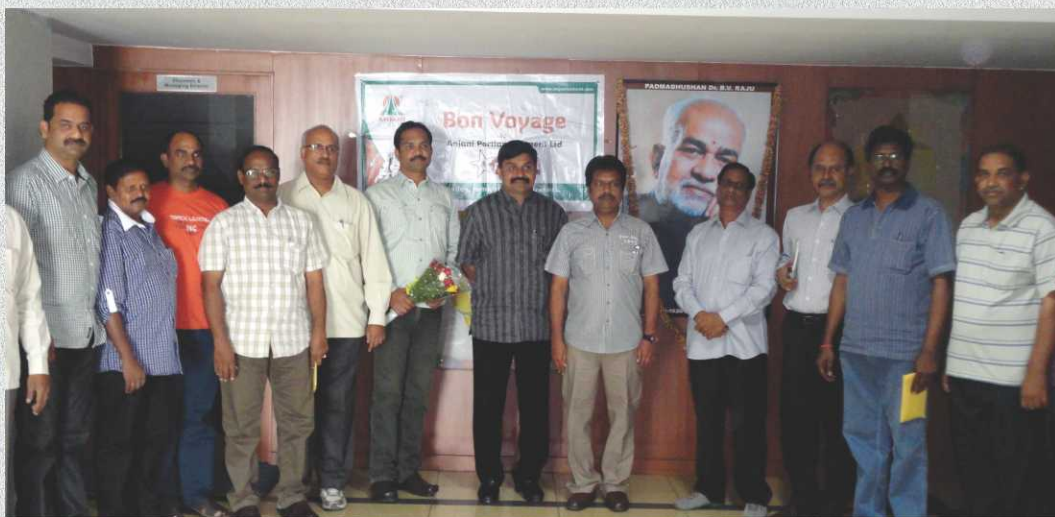
Rewarding the Dealers - First batch of Dealers Foreign Trip