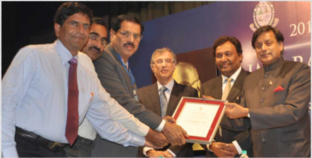
Anjani Portland Cement Limited Senior Executive Team receiving IMC Ramakrishna Bajaj Award 2011 Commendation Certificate from Hon. Parliament Member Mr. Shashi Tharoor at Mumbai.