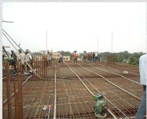
Slab constructed with the service of Nirmaan Sanjeevani at Tanuku