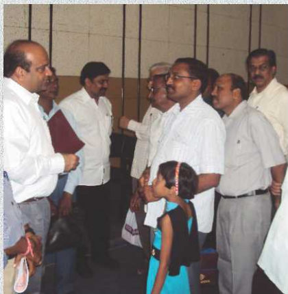
Interaction with Share Holders