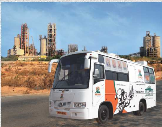
Nirmaan Sanjeevani, Mobile Concrete Solution