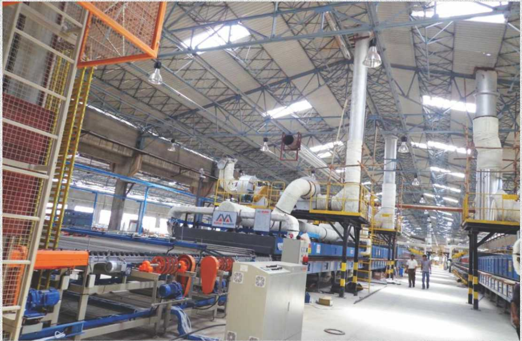
Vennar Ceramics Plant