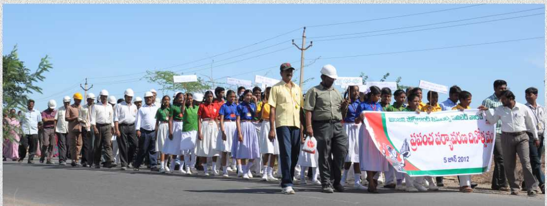
Employees of the Plant conducted a rally to bring awareness on Environment to the local people